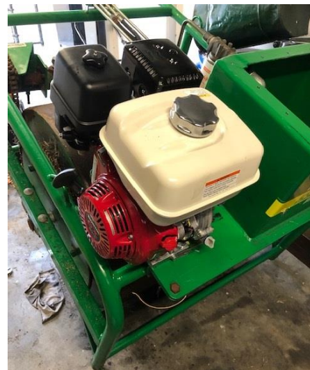
Mentay roller part way through refurbishment