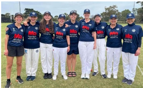
Our inaugural women’s team

All of our coaches and leaders displayed significant passion, patience and care undertaking their roles and I wish to thank each and every one of them for their contributions this season.