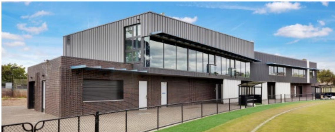
Elsternwick Park Oval 1 Pavilion

In 2018 the Club moved from the Alex Johnston Pavilion that it had occupied since the 1980's to a newly constructed state of the art facility. This $6.4M upgrade gives Elsternwick one of the best playing and social facilities in Melbourne.