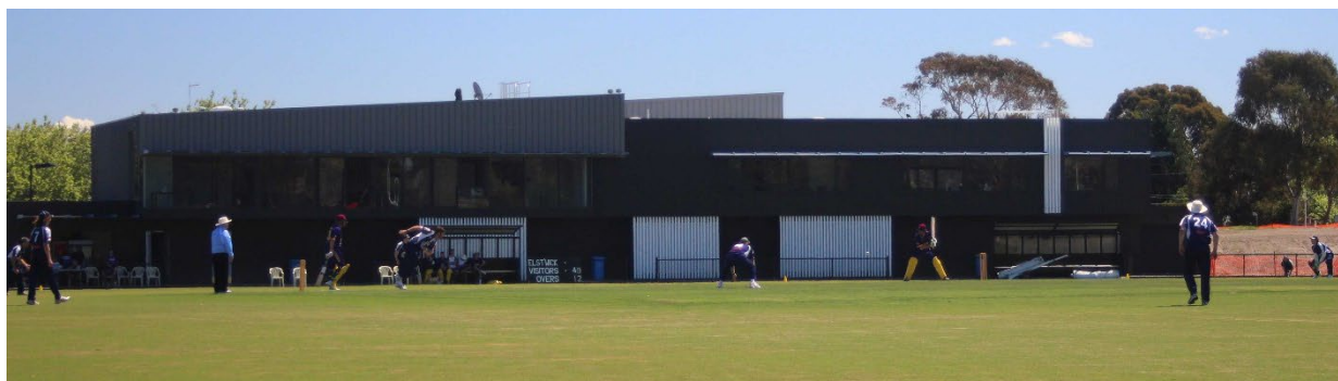
Elsternwick Park Main Oval and Pavilion