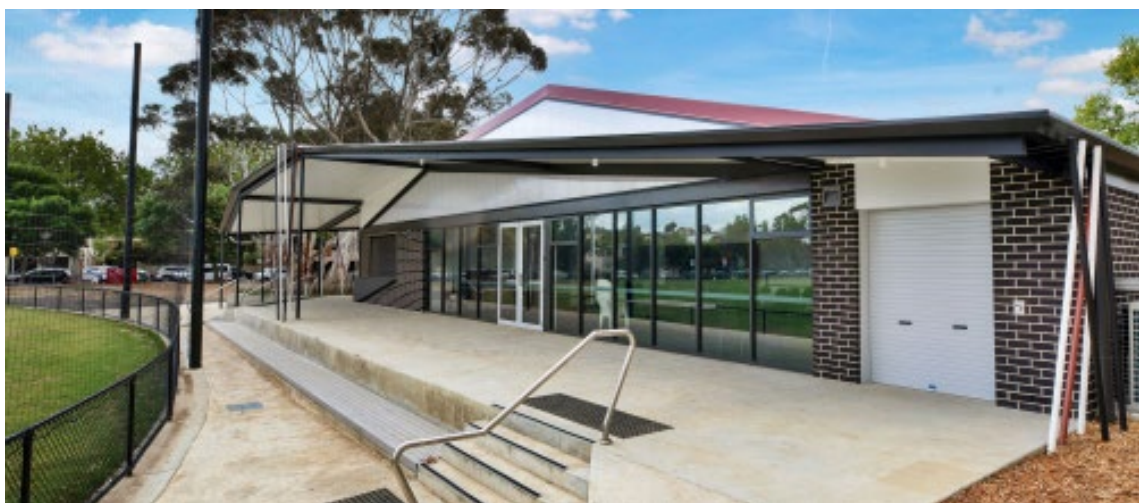
Holmes-Todd Oval Pavilion