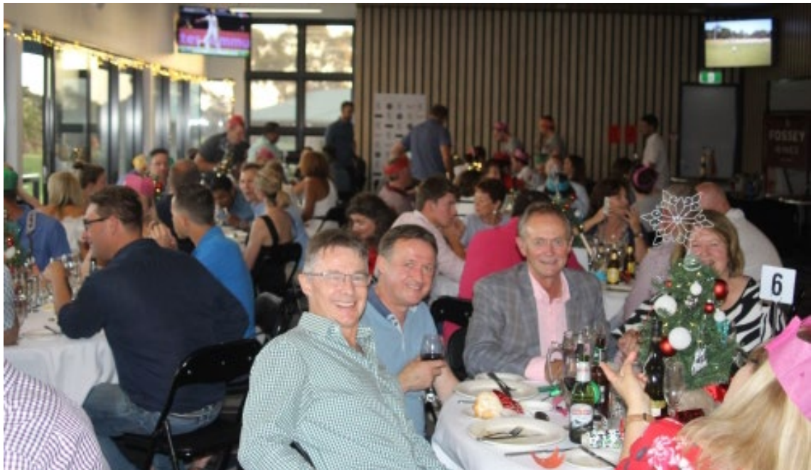
Elsternwick Christmas Party 2018

Junior Presentation Night. The quality of facilities enables the Club to organise profitable social functions and provide an active bar.