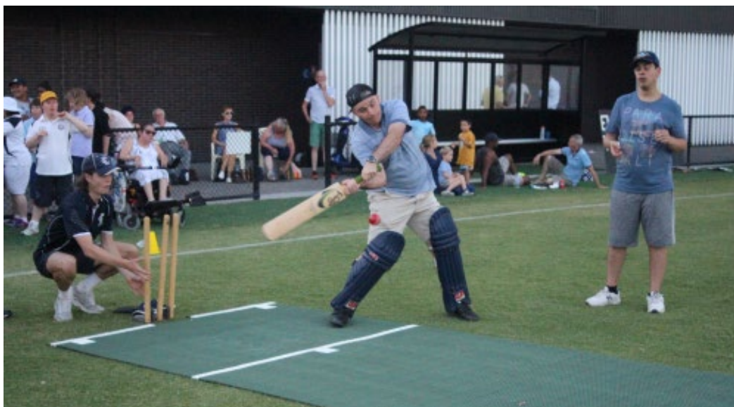
Bailey House Bushrangers – 2019

The annual Elsternwick vs Bayley House Bushrangers game is conducted towards the end of each season. Bayley House provides services for the intellectually disabled in the Bayside area and its clients certainly enjoy the game and post-match barbeque. This day is always a highlight of Elsternwick's year despite the Club never being able to record a victory against the strong Bayley House line up.